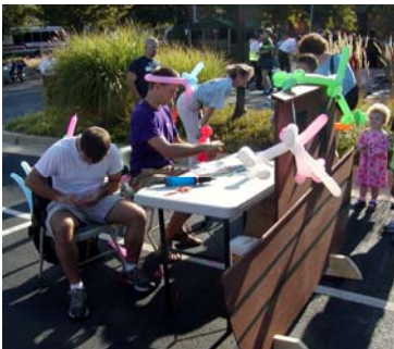
What's a Ministry Fair without balloon animals and an ark?

The Ministry Fair on Sunday, October 2 was a fun and exciting event where over 45 ministry teams at Columbia hosted booths to explain their ministries and how others can get involved with them. Over 60 "Trial Serves" were available to help those in attendance explore ministry at Columbia. Thanks to EVERYONE who helped to make it such a success!