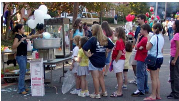
The Cotton Candy was a big hit!