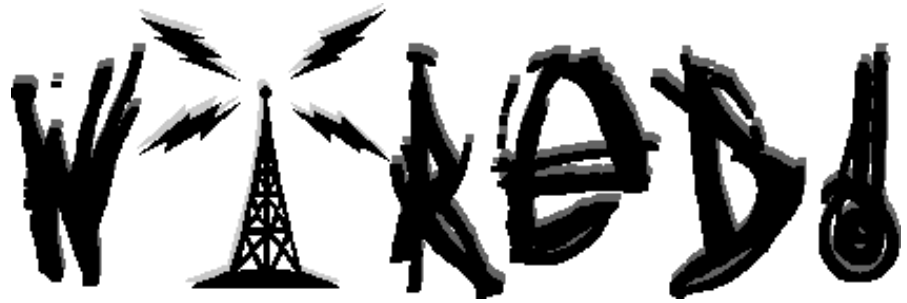
Worship Investment Relationships Evangelism Discipleship

Evidence obtained through exhaustive research suggests that the group has already been out for a movie, ice cream and paintball and has a great schedule