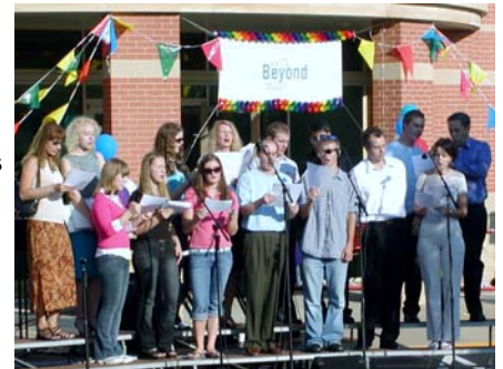
Columbia's Russian Congregation choir was one of the many groups that performed throughout the day.

The Fair was great but the important thing to remember is that "Living Beyond Myself" needs to continue as we continue to explore ministry together with the intention of finding the place to which God is calling and equipping us to serve.