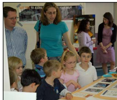
The XPO was visited by a children's class who also learned about serving at Columbia.