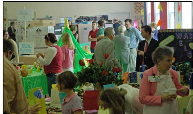
Many enjoyed the opportunity to fellowship as much as the chance to learn about our various ministry opportunities.