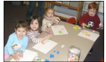
Little Lambs enjoying craft time.