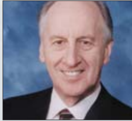
Jack Hayford (AUDITORIUM)