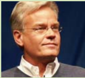
Bill Hybels (AUDITORIUM)